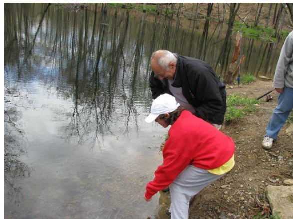
Rep. George examines a stream with a young citizen

Of the 4 million gallons of fracking fluid used for hydraulic fracturing, up to 70 percent of the fluid may flow back to the surface, though the typical range is 0 to 30 percent. The rest of the fluid (or sometimes, all of the fluid) remains deep underground. The Marcellus Shale formation is thousands of feet underground, below any underwater aquifers connected to our drinking water supply, but a risk, however small, does exist that undetected natural fractures in the geologic formation may allow frac fluid to flow to untraceable places, including an underwater aquifer. The greater risk to underground drinking water supplies, however, is due to improper casing during the drilling process, which may allow frac fluid to leak before it ever reaches the Marcellus Shale formation deep underground. Rep. George has legislation to prevent this, through mandatory inspections of well sites during all phases of the drilling process.